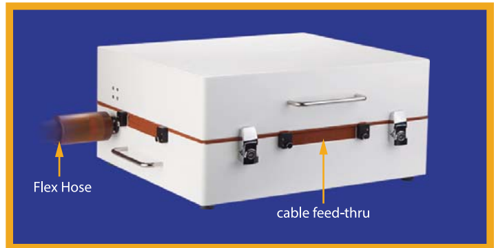
Compact Chamber Clamshell Model Chamber 14Wx16Dx6.2H inches