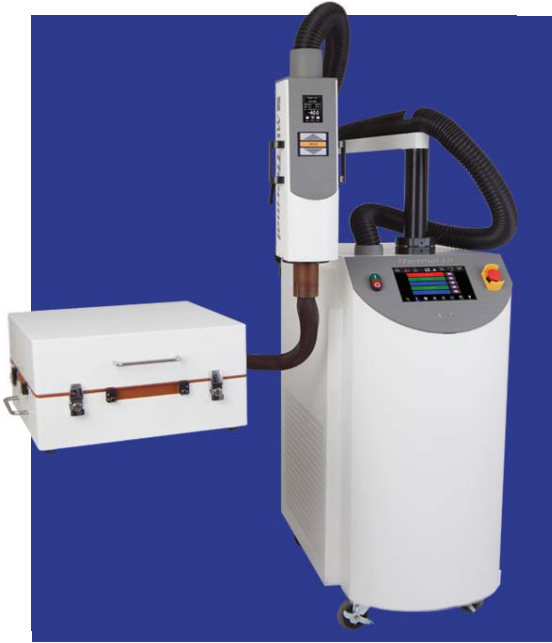
TA-5000A with Compact Chamber Clamshell

ThermalAir Compact Chamber Clamshell is for temperature testing all types of components such as automotive sensors, fiber optic components, microwave hybrids, MCM, PCB or any type of electronic / non-electronic parts. ThermalAir Compact Chamber can integrate as part of your test.