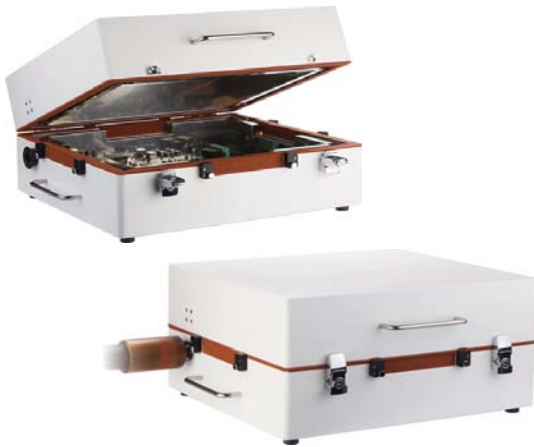
Clamshell Compact Chamber Open/Close Easily